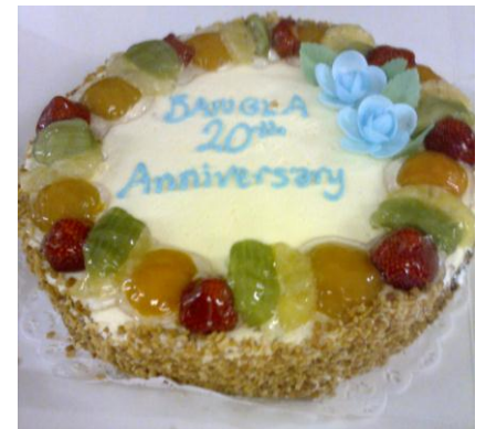
Picture: Bangla's 20 th Anniversary cake was one of the many delicacies enjoyed by everyone attending the Residents Fun Day on 28.07.11