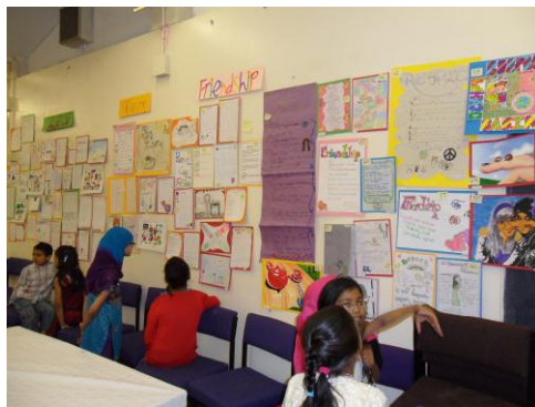
Picture Above: Exhibition of children's work at the Resident's Fun day held on 28.07.11