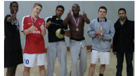
Above: The winning team from last year's competition

This year's five-a-side football competition for youths and children aged 15-18 years will be held at: