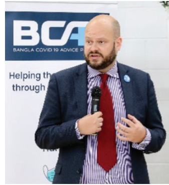
Philip Glanville, Mayor of Hackney

The event ended with a mouth-watering Bangladeshi buffet and refreshments.