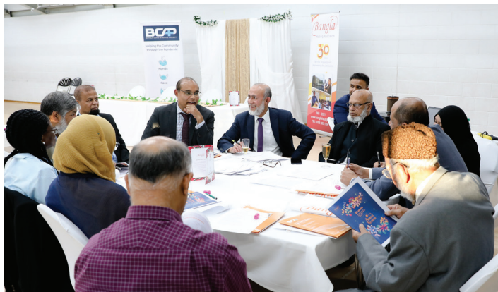
Bangla Housing Association's 30th AGM held on 16.09.2021 at the North London Muslim Community Centre, Hackney