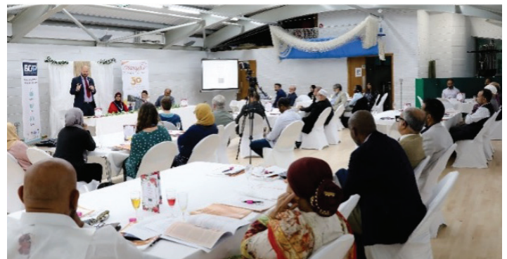
Over 50 people representing Bangla HA Board members, staff, residents, guests, and members from the community attended the event held on 16.09.2021