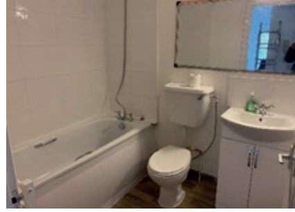
New Bathroom at Downs Rd. This is one of 4 new bathrooms we installed in 2021/22