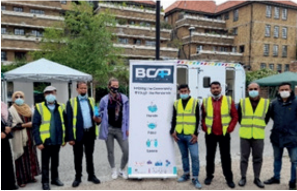
Bangla HA staff and volunteers at the pop-up vaccine clinic organised by Bangla HA and Hackney Central Mosque supported by the NHS, Hackney Volunteer Centre, and Hackney Community Health Team 27.06.2021

We steadfastly maintained our housing management services and other regulatory obligations by making good use of modern technology, the internet, and social media. Adhering to the governments prevailing guidelines and safeguarding health and safety of our staff, residents, and contractors we managed to meet the targets in all our key performance areas.