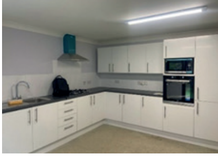
New Kitchen at Gliddon Drive. This is one of 9 new kitchens we installed in 2021/22

During the year we complied with fire safety regulations. We communicated with all our residents to reassure them that their buildings are safe and advised them about their responsibilities to keep all communal areas and their homes safe from any fire risks. All gas checks are up to date and any works as recommended following our annual Fire Risk Assessments were carried out promptly.