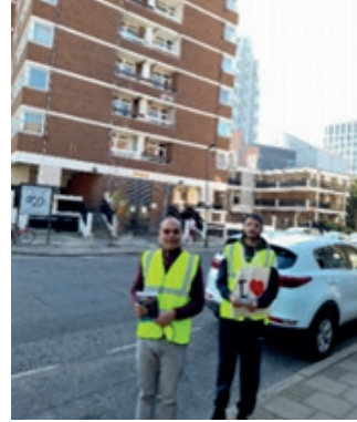
Bangla Housing volunteers delivering vaccine flyers at the Haberdasher Estate, Hoxton West 19.03.2022

কোভিড-১৯ মহামারী এবং আমাদের প্রতিক্রিয়া