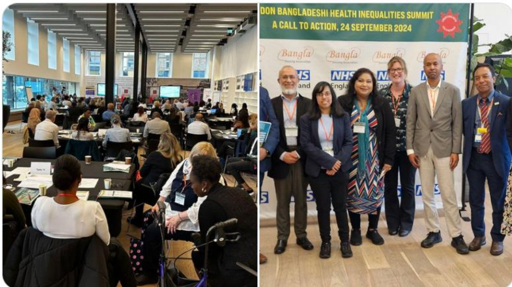
Barts Health and 9 others

This ground-breaking event united over 130 key stakeholders from various sectors, including the NHS, public health teams, and the VCSE sector, Show more